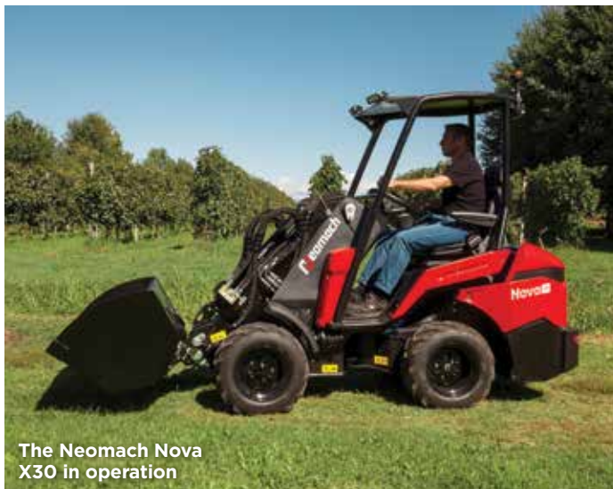
The Neomach Nova X30 in operation

Note: esDrive has auto full performance, eco reduced revs driving speed, selectable independent ground/engine speed control with overload protection, and pedal speed control modes.