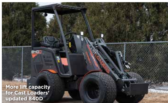
More lift capacity for Cast Loaders' updated 840D