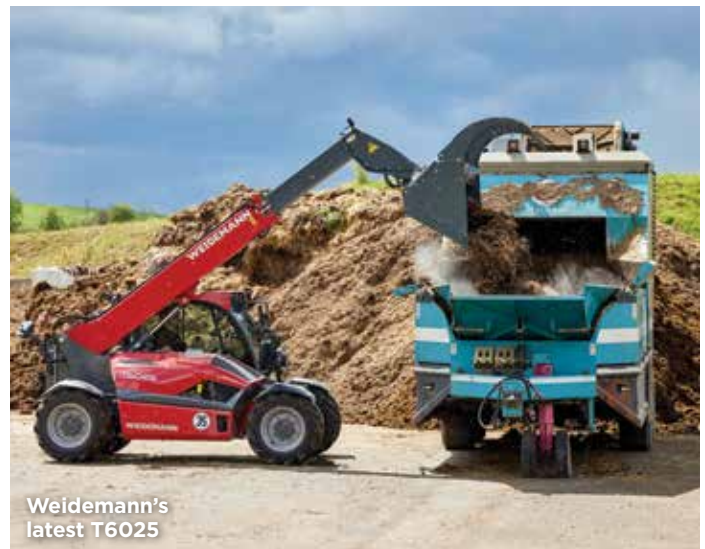
Weidemann's latest T6025