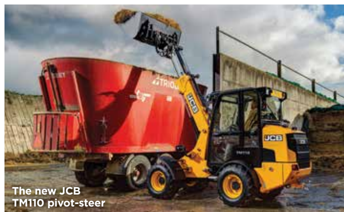
The new JCB TM110 pivot-steer