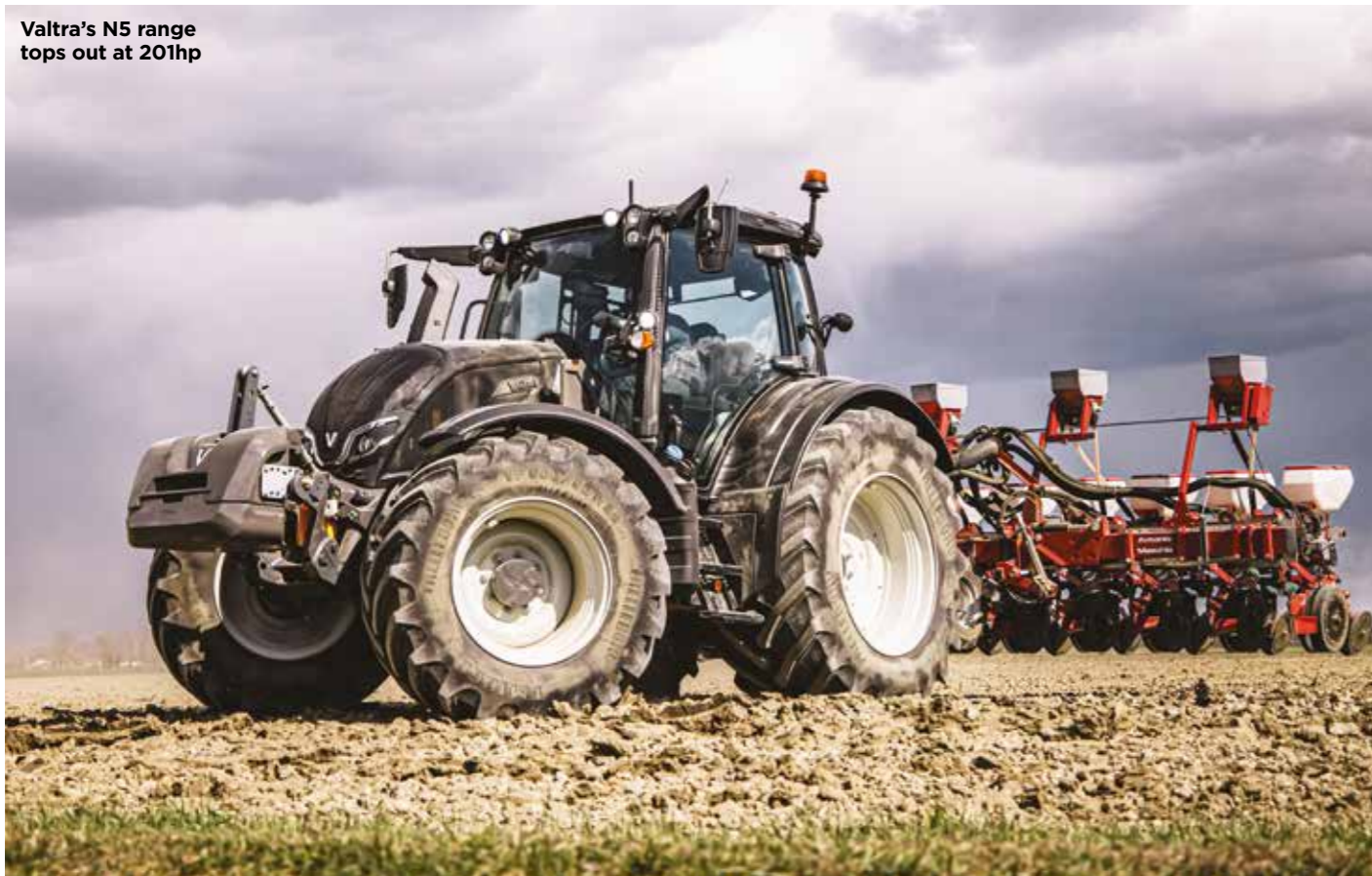
Valtra's N5 range tops out at 201hp