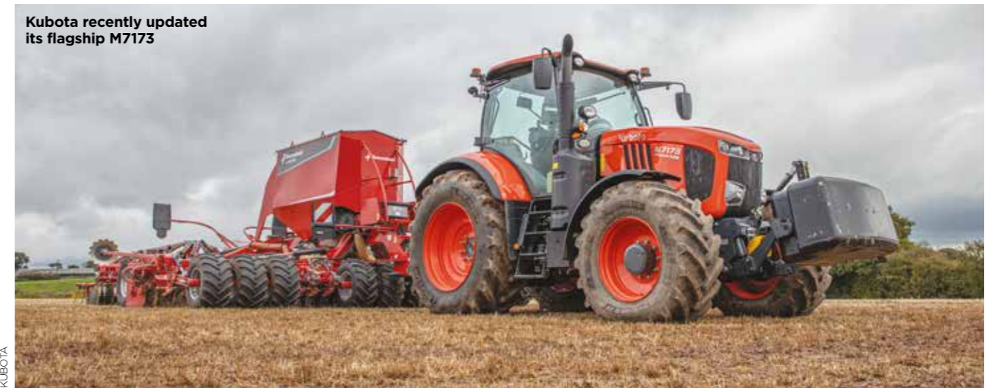
Kubota recently updated its flagship M7173

Landini 4-series tractors have Kohler KDI engines with EGR, DOC and DPF for Euro Stage V emissions compliance.