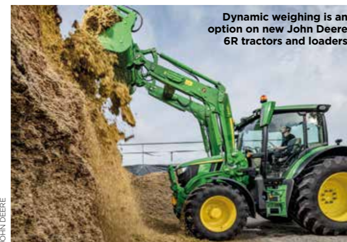
Dynamic weighing is an option on new John Deere 6R tractors and loaders