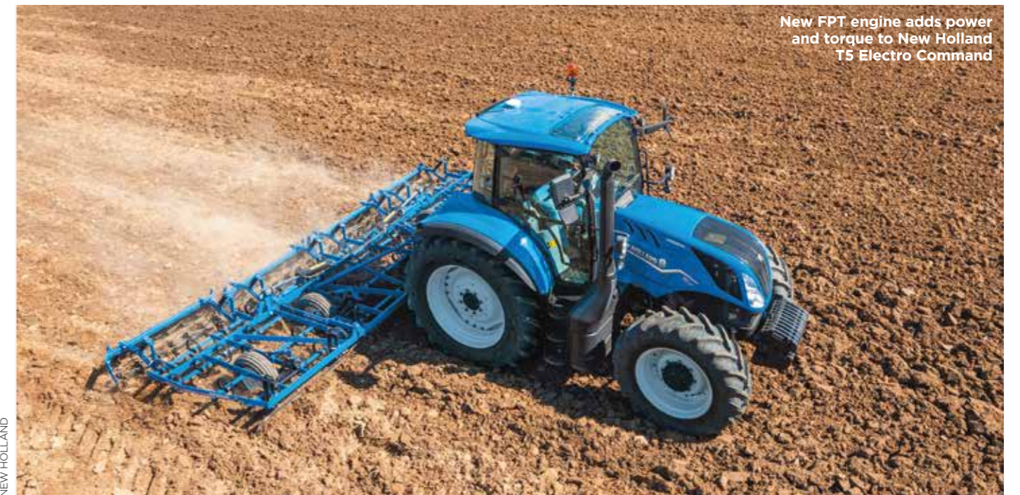
New FPT engine adds power and torque to New Holland T5 Electro Command