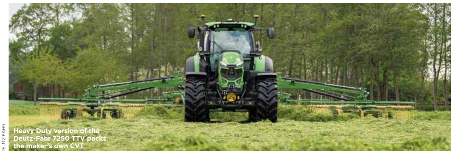
Heavy Duty version of the Deutz-Fahr 7250 TTV packs the maker's own CVT