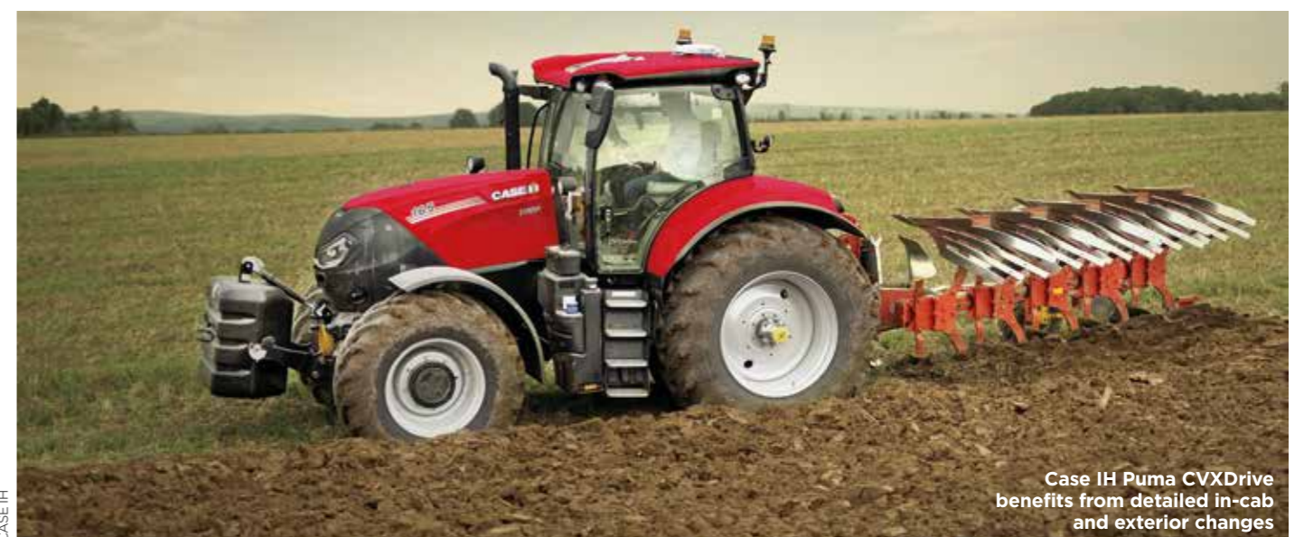
Case IH Puma CVXDrive benefits from detailed in-cab and exterior changes

Case IH Farmall C tractors have FPT F5-series F36 engines with EGR, DOC, DPF and SCR for Euro Stage V emissions compliance.