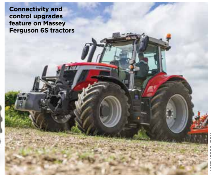
Connectivity and control upgrades feature on Massey Ferguson 6S tractors