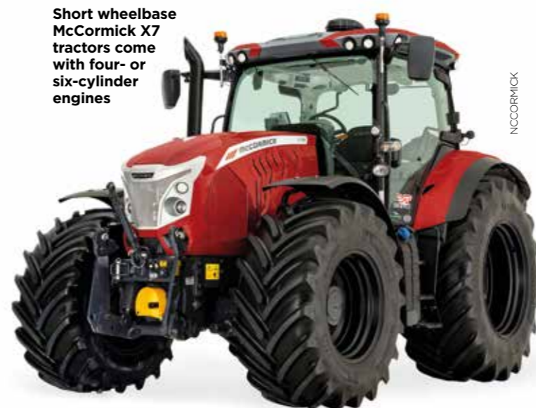
Short wheelbase McCormick X7 tractors come with four- or six-cylinder engines