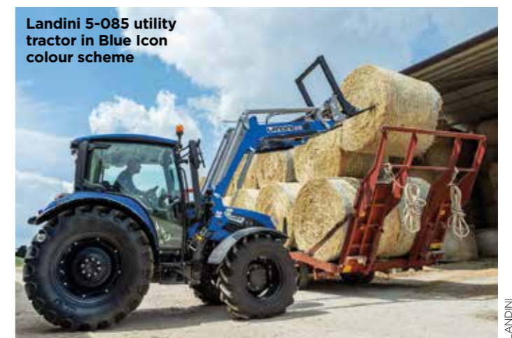
Landini 5-085 utility tractor in Blue Icon colour scheme