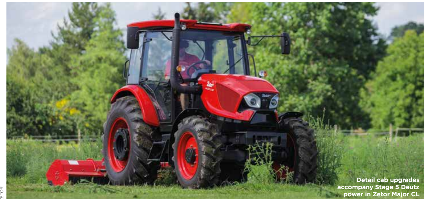
Detail cab upgrades accompany Stage 5 Deutz power in Zetor Major CL

Zetor Crystal 170 HD tractor has a Deutz TCD engine with EGR, SCR, DOC and DPF for Euro Stage V emissions compliance.