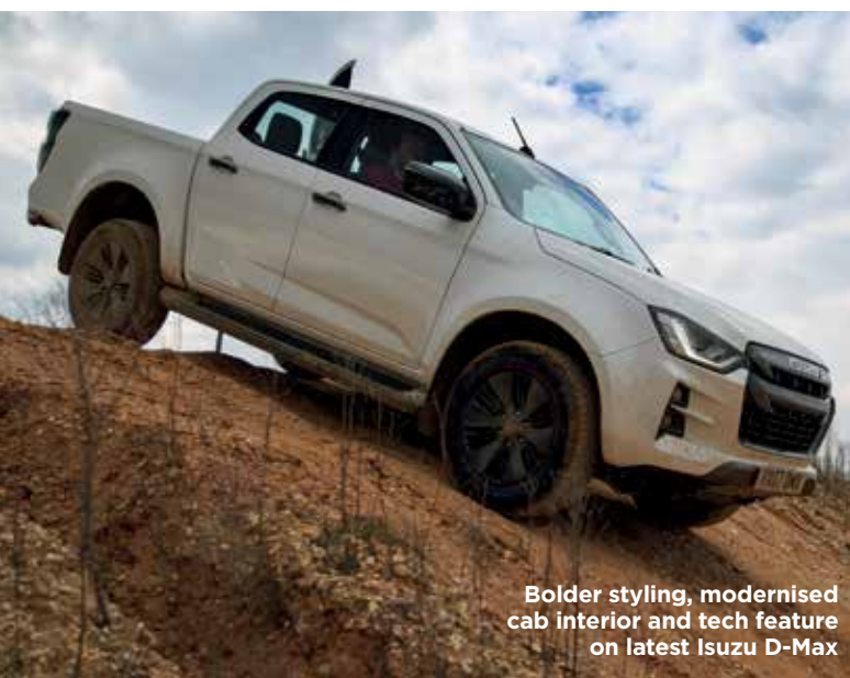
Bolder styling, modernised cab interior and tech feature on latest Isuzu D-Max