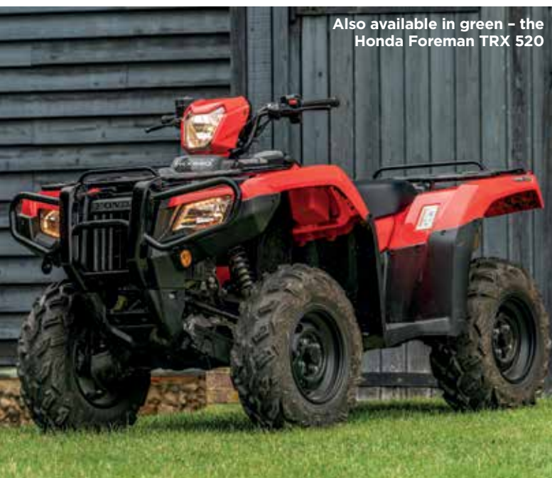
Also available in green - the Honda Foreman TRX 520