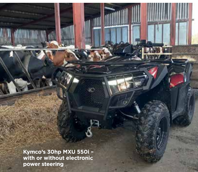
Kymco's 30hp MXU 550i - with or without electronic power steering