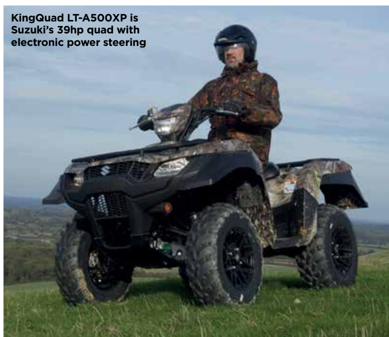
KingQuad LT-A500XP is Suzuki's 39hp quad with electronic power steering