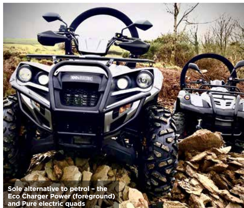
Sole alternative to petrol - the Eco Charger Power (foreground) and Pure electric quads