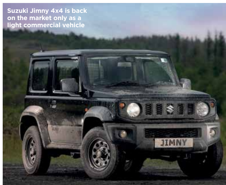
Suzuki Jimny 4x4 is back on the market only as a light commercial vehicle